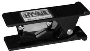
TC-1 Tubing Cutter